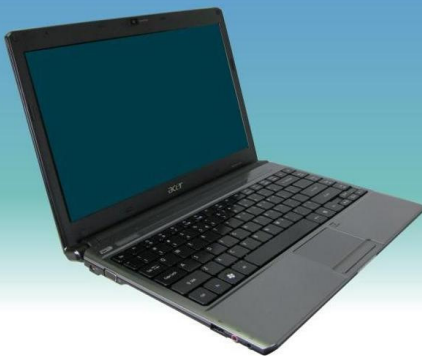
Figure 1: MobileMark 2007 Productivity 2007 battery life score for the Acer Aspire Timeline 3810T notebook system.

Acer Aspire Timeline 3810T runs 9 hours, 7 minutes on a single battery charge.